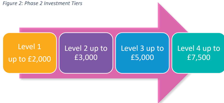
Figure 2: Phase 2 Investment Tiers

Schools were able to apply for awards from £2,000 up to £7,500 for revenue-based pupil or community focussed projects that encompassed the priorities set out.